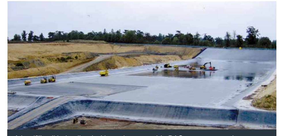
A landfill cell being lined with our impermeable DAC system, even the ramps into the cell can be completely sealed with our DAC and then trafficked.

Many sites throughout Mainland Europe and the UK have been lined by WALO, with slopes up to 1:1.5. WALO have extensive experience in laying DAC to steep slopes thereby providing considerable confidence in The slope inclination is determined by the stability of the product we provide.